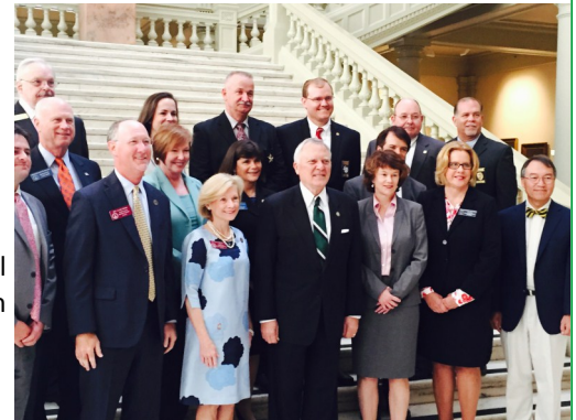
Georgia’s Medical Cannabis Commission